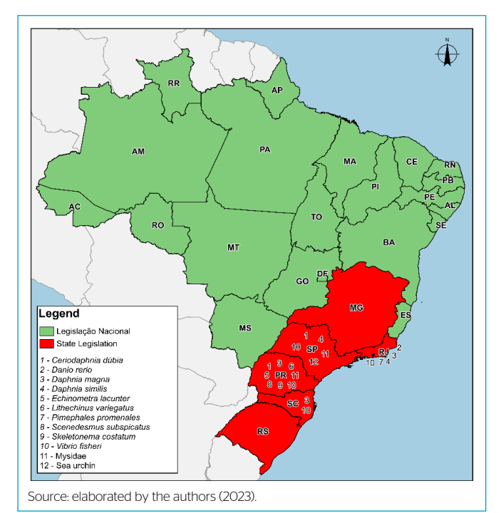
Figure 2 - States and species accepted in their guidelines. Green: States that have their own legislation; Red: states that do not have their own legislation; 1 to 12:

indicator species accepted in the legislation of each state.