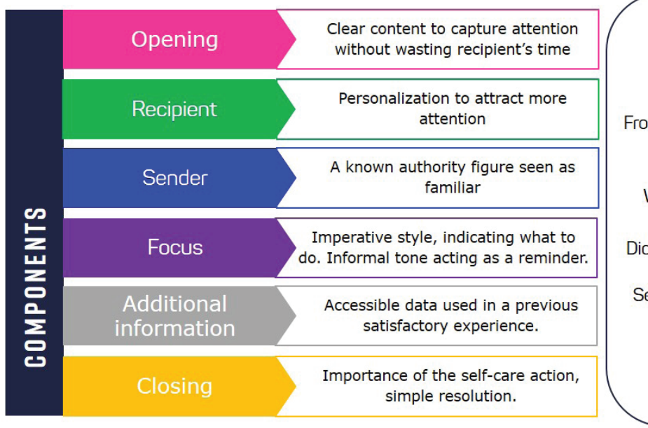
Figure 2. Components, main arguments, and final message designed

Study researchers produced a draft version of the SMS message that was presented to the provincial and national health authorities. This validation stage did not present relevant divergences or inconsistencies in the results of the FGs regarding the interpretation and understanding of the proposed message. However, they noted that "Health care center" as a sender could be confusing to women because is not usual that a health care center sent this kind of SMS message. Thus, the final version used the Cancer Control Agency, a sender accepted by both women and authorities (Figure 2).