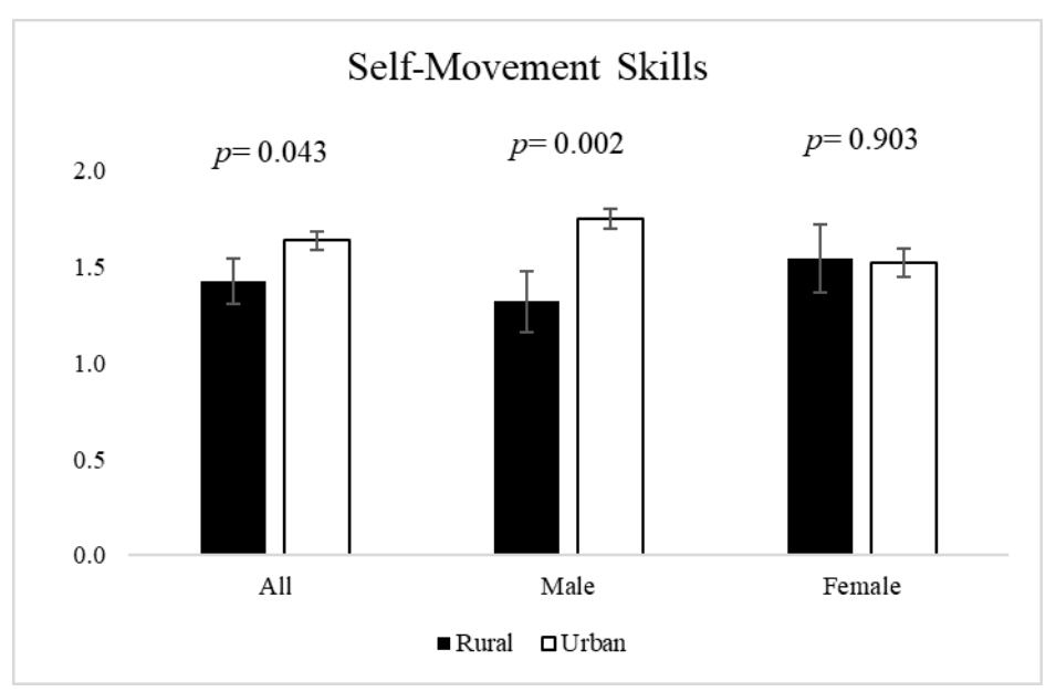
Figure 1. Differences in self-movement skills between urban and rural schoolchildren aged 3 to 5 years. One factor analysis of variance (ANOVA) was conducted with geographical location as a fixed factor and self-movement skills as the dependent variable

When examining the differences in self-movement and object control skills between preschoolers from rural and urban settings, the findings reveal that rural boys possess lower self-movement skills compared to their urban counterparts, with a significant difference (Figure 1, p=0.002). In contrast, rural girls show a similar level of self-movement skills to urban girls (Figure 1, p>0.05). Regarding object control skills, the analysis indicates that boys from rural areas generally underperform relative to those from urban areas, with this difference reaching statistical significance (Figure 2, p=0.013). Similar to the pattern observed in self-movement skills, rural girls do not demonstrate significant variations in object control skills based on their living environment (Figure 2, p>0.05). Finally, it should be noted that in rural areas, girls have slightly better motor skills than boys, which is the opposite of what happens in urban preschools, where boys tend to have better motor skills