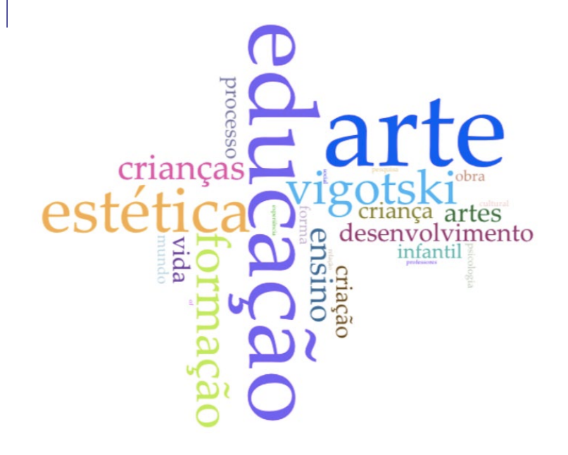
Figure 1 Word tree generated by Voyant Tools

As can be seen, the words in blue, violet, and orange stand out as the most referenced terms, in order of decreasing size ("art", "education", and "aesthetics"). The result validated in the second check corroborates those of the first phase of the research, in which it was evidenced, by tracking the articles and reading the abstracts, that the concept of aesthetic education transits in different areas, but is located, above all, in the field of Art Education. The concept maps presented in Figures 2 and 3 show direct links between the three main terms accounted for in the image generated by the word tree. The other terms generated, correlated to the three central axes of the discussion on Art Teaching, pointed out in Figure 1, make up the discussion scenarios (theoretical and contextual) in which the articles are inserted.